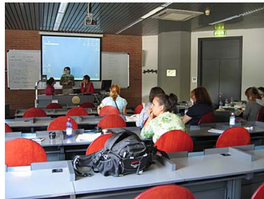
(Left – ILUM interior atrium; Right – our classroom)