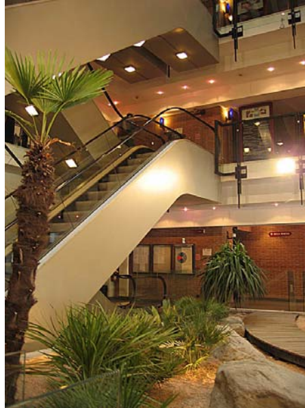
(Left – part of campus; Right – interior of main building)