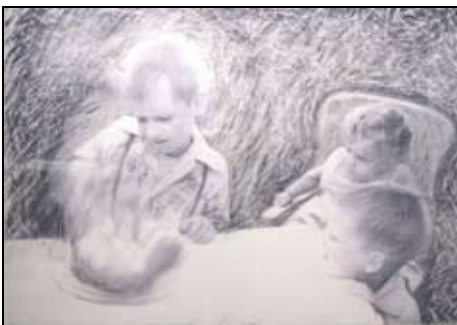
TOP: VESTURE SERIES 0110 MIDDLE: DICROTA BOTTOM: TANDEM CONCERN