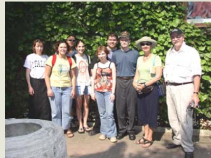
USC Upstate Italy Trip Summer 2003

The only way to truly become fluent in a language is to be immersed in it. If you've studied a language for several years and wish to gain fluency in that language, we can offer you the opportunity to gain fluency in a number of languages.