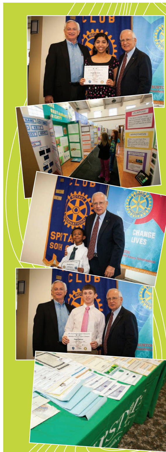
HM = Honorable Mention